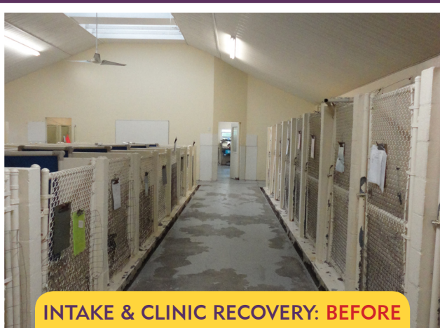
INTAKE & CLINIC RECOVERY: BEFORE

INTAKE & CLINIC RECOVERY: Also decades-old, this area is the first place a surrendered canine stays for observation, and is also used as a recovery area after clinical procedures. New flooring, gates, and other improvements are needed to ensure the greatest level of comfort for the animals in our care.