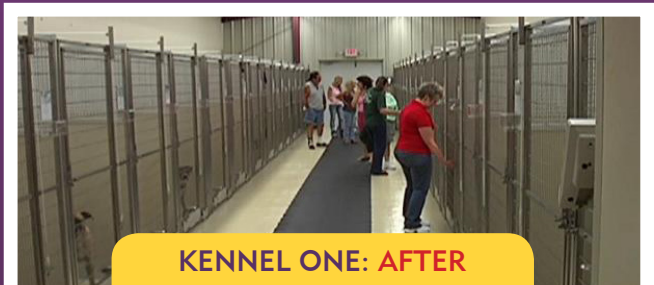
KENNEL ONE: AFTER

KENNEL ONE: The original canine housing at GCHS is decades-old, and is in need of new gates for the dog runs, floor repairs, safety stations, automatic watering systems, and more.