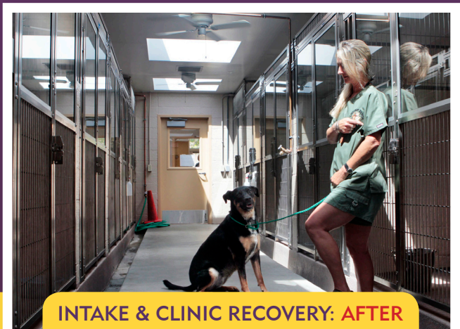
INTAKE & CLINIC RECOVERY: AFTER

INTAKE & CLINIC RECOVERY: Also decades-old, this area is the first place a surrendered canine stays for observation, and is also used as a recovery area after clinical procedures. New flooring, gates, and other improvements are needed to ensure the greatest level of comfort for the animals in our care.