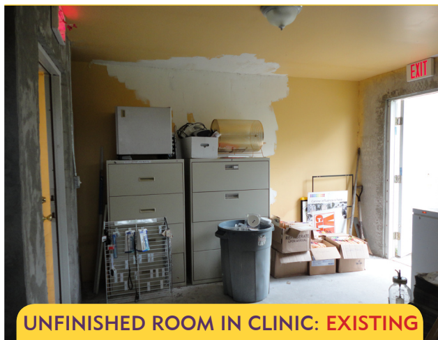
UNFINISHED ROOM IN CLINIC: EXISTING

QUARANTINE/ISOLATION FACILITY: Currently GCHS does not have a state-of-the-art facility to properly isolate an animal who shows symptoms of an infectious disease. An unfinished room at the far corner of the GCHS Vet Clinic with a separate entrance/exit is the perfect location for our new quarantine facility.