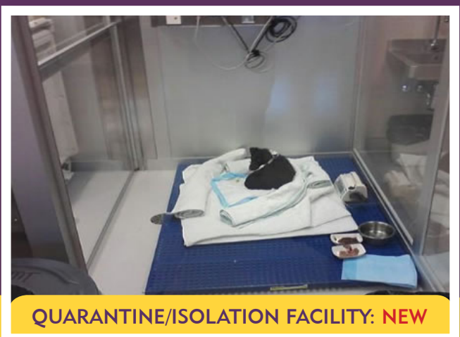
QUARANTINE/ISOLATION FACILITY: NEW

QUARANTINE/ISOLATION FACILITY: With a dedicated isolation room with modern equipment, we can maximize the comfort of an animal and speed their recovery, and also minimize the risk of spreading disease to other pets at the shelter.