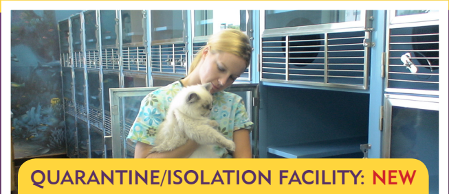
QUARANTINE/ISOLATION FACILITY: NEW

QUARANTINE/ISOLATION FACILITY: Currently GCHS does not have a state-of-the-art facility to properly isolate an animal who shows symptoms of an infectious disease. An unfinished room at the far corner of the GCHS Vet Clinic with a separate entrance/exit is the perfect location for our new quarantine facility.