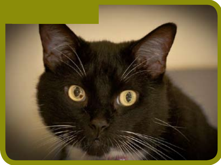
- Gabby - 10 years old Female

Big, bold and beautiful Gabby has been with us since April 2008 and is looking forward to finding her perfect family. She is a tuxedo cat with a huge personality. Gabby needs an experienced cat owner who understands her independent spirit. She loves to be petted, groomed and cuddled, but on her own terms. She is not too keen on living with other cats, especially older or shy cats, or cats that want to be the boss. That is Gabby's job! She would be ideal for any home with adults or children over 10 years old.